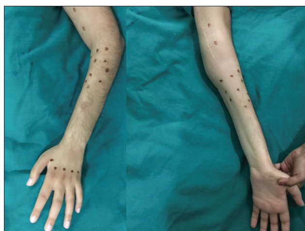
Figure 2: Henna marking of the stimulation points on the left upper limb