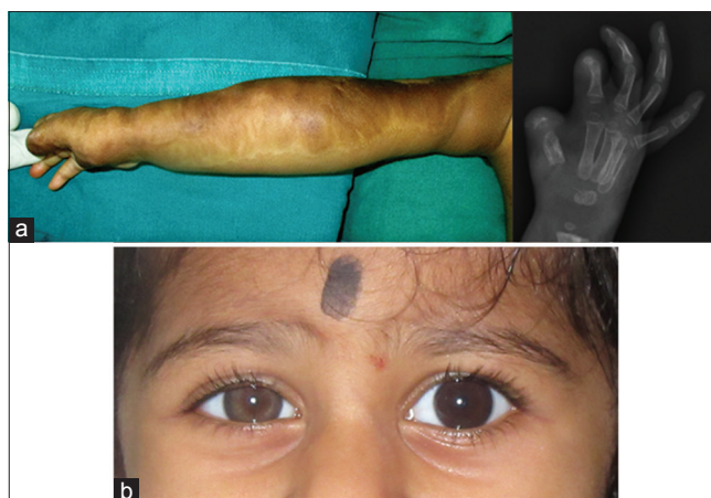
Figure 1: (a) Cicatricial skin lesion along the pre-axial border of the right upper limb, with X-ray of the right hand showing hypoplasia of the thumb and index finger. (b) Hypochromia of the right iris

Given the age of the child, an exploration of the brachial plexus was not indicated. However, an Oberlin's nerve transfer could possibly be performed to attempt restoration of elbow flexion. Hence, the arm was explored for the status of the musculocutaneous nerve. During surgery, the biceps was found to be completely pale and had