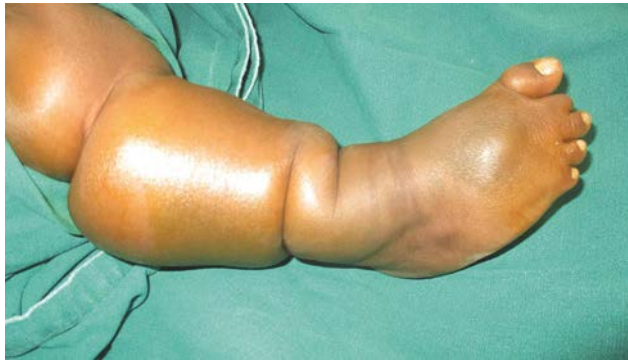
Fig. 1 Preoperative picture showing the constriction rings around the leg with distal swelling.