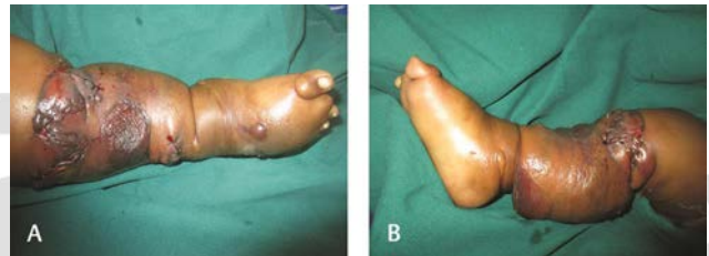
Fig. 4 (A,B) Blisters around the leg suggesting compromise in the skin circulation.

mild). 1 Three hundred IU of factor IX was administered intravenously. The dose was repeated the next day. No further bleeding episodes occurred, and the dressings remained dry. Sutures were removed on the 19th day. Spotty raw areas at the blister sites took 3 weeks to heal. At 3 months follow-up, the child was comfortable, with reduction in the size of the foot and leg (►Fig. 5a–c). All the other operated sites in the hand and groin healed well.