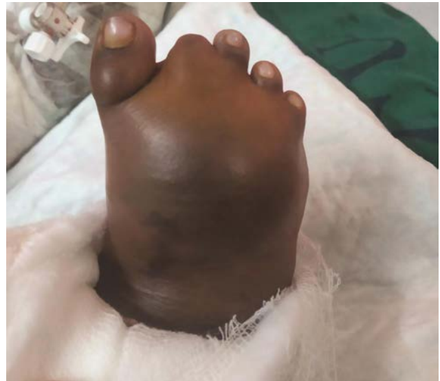
Fig. 3 Subcutaneous spreading of the hematoma causing darkening of the skin.

The hemoglobin level was 4.5 g/dL and the Activated partial thromboplastin time was 70.6 seconds (normal: 25–35 seconds). Prothrombin time was normal. We administered 100 mL PRBC and 80 mL FFP. The leg became warmer, but skin blisters erupted on the leg and foot denoting skin ischemia (►Fig. 4a,b). The hematologist advised to do the coagulation profile analysis 12 to 15 hours after the last FFP transfusion. To cover the period, we administered 250 mg tranexamic acid intravenously and as soaked gauze dressings over the wound and 50 mL of cryoprecipitate. Tests revealed a deficiency of factor IX with only 1.2% of the factor available. A diagnosis of moderate hemophilia B (Christmas disease) was made (less than 1%: severe, 1–5%: moderate, 5–50%: