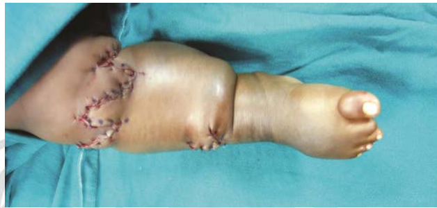
Fig. 2 Immediate postoperative period after releasing the constriction rings with Z-plasty.

no specific active bleeders. We reinforced the skin sutures. The hand and groin wounds were given compression dressings. Eight hours later the leg dressings were heavily soaked. Diffuse bleeding was present on re-exploration. We administered 20 mL fresh frozen plasma (FFP) and 130 mL packed red blood concentrates (PRBC). Six hours later, the next day morning, the baby was comfortable.