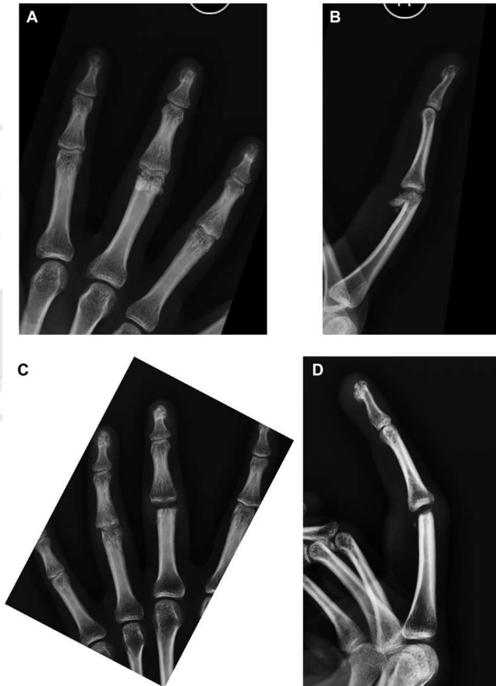
Fig. 5 (A) Preoperative Xray AP view. (B) Preoperative xray lateral view. (C) Post operative follow-up xray AP view. (D) Post operative follow-Up xray lateral view.

The success of this procedure relies on several important factors. First, the volar plate should be uninjured, and precautions should be taken to ensure the distal and proximal ends of the volar plate are intact. Second, the radial and ulnar edges of the distal PPx should be at the same level. Unequal ends may result in deviation of the finger. Third, collateral ligament integrity should be ascertained, just as in Tupper's arthroplasty, which is crucial for stability of the joint. Stability