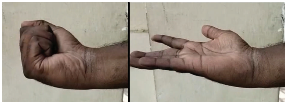
Fig. 4 Clinical outcomes after 3 years.