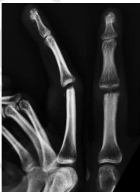
Fig. 3 Check radiographs revealed the neck cut in the proximal phalanx to be sloping ulnar wards.

Two important factors in achieving good range of movement at the PIPJ are concentricity of the articular surfaces and early ROM. 5 Joint stability is provided by the shape of the MPx that fits on the head of the PPx, along with soft tissue structures. Concentricity of the surfaces with respect to each other enables them to work in sync, naturally maintaining stability through the range of movement. Since the MPx base was intact, in our patient, the focus was to recreate the impaired contour of the head of PPx by draping the thick volar plate over the remaining neck of PPx, which cannot be achieved by the standard Tupper's arthroplasty. PPx head fractures are contraindicated in VPA, 3 which will fail without an intact PPx head to support it.