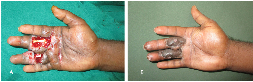
Fig. 3 A 34-year-old male with infection and soft-tissue loss over the flexor aspect of his right middle and ring fingers following a trivial injury sustained 11 days earlier. He underwent debridement of the wounds and pedicled abdominal flap cover. (A and B) 6 months follow-up pictures. Trophic changes at the tips of fingers and at the apex of the flap in the middle finger due to lack of sensation.