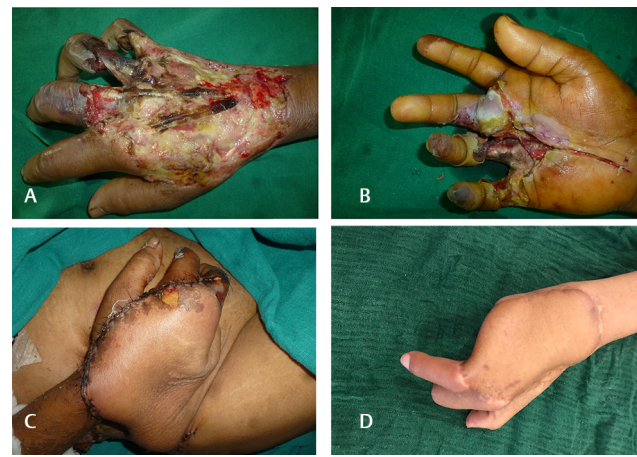
Fig. 5 (A and B) A 56-year-old lady presented to us with gangrene of the medial three fingers of her right hand following a thorn prick injury sustained 15 days earlier. (C) Debridement, amputation of the ring and little fingers with a pedicled abdominal flap cover were done. (D) 7 years follow-up picture.

for the hand infection. Three years after the hand infection episode, he underwent left below knee amputation elsewhere for diabetic foot ulcer and expired 3 weeks post amputation.