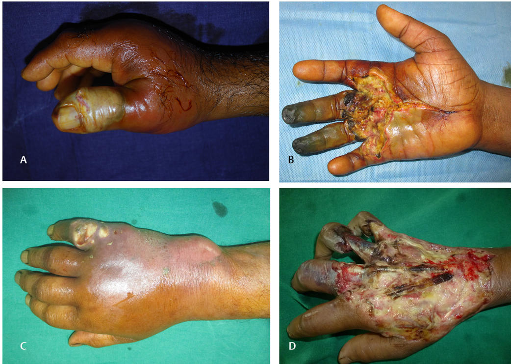
Fig. 1 (A, B, C and D) Varied presentation ranging from paronychia to necrotizing fasciitis.

underwent two or more surgeries. Flap division and surgical syndactyly separation were excluded from this count. Seven patients needed repeat debridement, and 17 patients underwent reconstructive surgery in the form of tendon repair (1), split thickness skin grafts (5), local transposition flap (1), cross finger flap (3) and groin/hypogastric flap (7) (►Figs. 3, 4 and 5, 4 and 5). Primary flap cover was done in 3 out of the 11 patients who underwent flap cover. In the other eight patients, the mean time interval between debridement and flap cover was 15 days. The skin grafts showed 100% take, and all the flaps survived. The mean duration of hospital stay was 6 days.