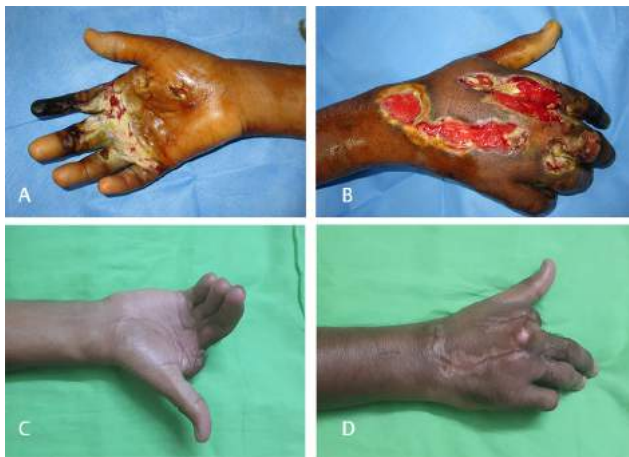
Fig. 4 (A and B) A 36-year-old male with spontaneous onset of gangrene of his right index finger presented to us 17 days later with dry gangrene of the whole index finger, slough in the distal palm, and raw areas on the dorsum of the hand. Debridement, amputation of index finger with split-thickness skin graft (SSG) cover for the dorsum done. (C and D) 10 months follow-up pictures.