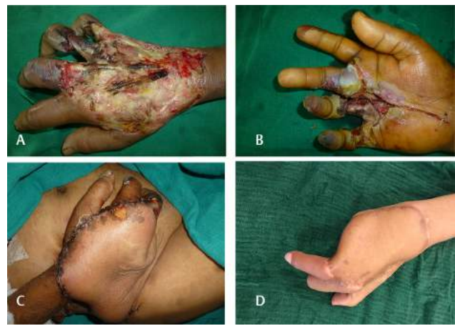
Fig. 5 (A and B) A 56-year-old lady presented to us with gangrene of the medial three fingers of her right hand following a thorn prick injury sustained 15 days earlier. (C) Debridement, amputation of the ring and little fingers with a pedicled abdominal flap cover were done. (D) 7 years follow-up picture.

for the hand infection. Three years after the hand infection episode, he underwent left below knee amputation elsewhere for diabetic foot ulcer and expired 3 weeks post amputation.