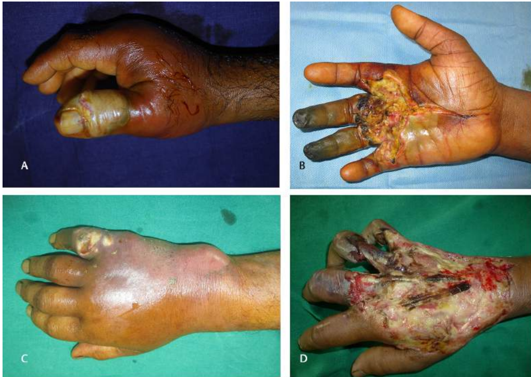
Fig. 1 (A, B, C and D) Varied presentation ranging from paronychia to necrotizing fasciitis.

underwent two or more surgeries. Flap division and surgical syndactyly separation were excluded from this count. Seven patients needed repeat debridement, and 17 patients underwent reconstructive surgery in the form of tendon repair (1), split thickness skin grafts (5), local transposition flap (1), cross finger flap (3) and groin/hypogastric flap (7) (►Figs. 3, 4 and 5, 4 and 5). Primary flap cover was done in 3 out of the 11 patients who underwent flap cover. In the other eight patients, the mean time interval between debridement and flap cover was 15 days. The skin grafts showed 100% take, and all the flaps survived. The mean duration of hospital stay was 6 days.