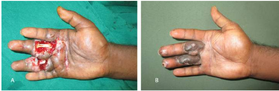
Fig. 3 A 34-year-old male with infection and soft-tissue loss over the flexor aspect of his right middle and ring fingers following a trivial injury sustained 11 days earlier. He underwent debridement of the wounds and pedicled abdominal flap cover. (A and B) 6 months follow-up pictures. Trophic changes at the tips of fingers and at the apex of the flap in the middle finger due to lack of sensation.